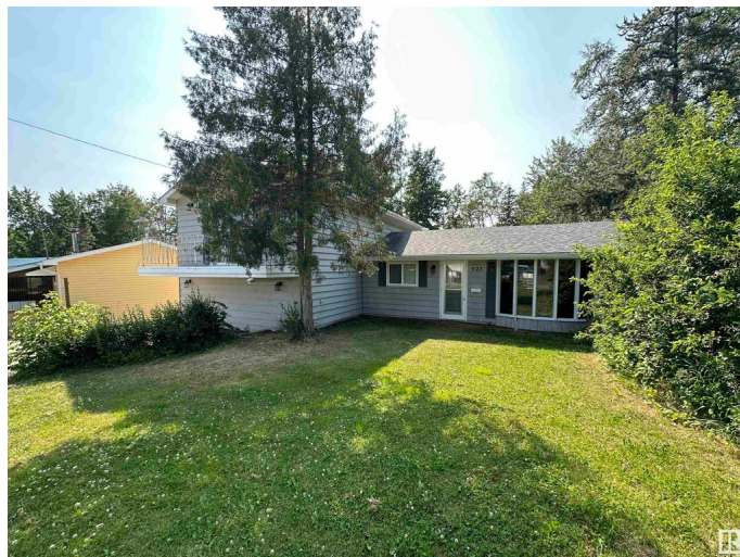
527 5 St, Gunn, AB

Main Floor Exterior Area 1535.62 sq ft Interior Area 1444.08 sq ft