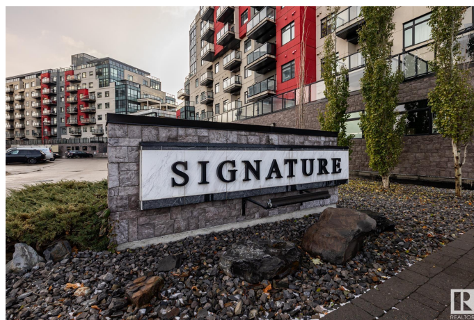
Main Building: Total Interior Area Above Grade 1442.81 sq ft